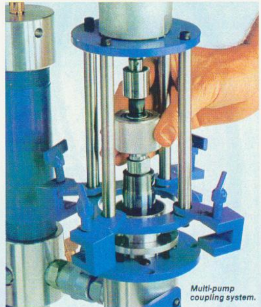
Multi-pump coupling system.

The Airmix unit is available as a gelcoater, resin wet-out, chopper gun, multi-pump combinations and all hardchromed pumps for spraying filled resin/gelcoat.